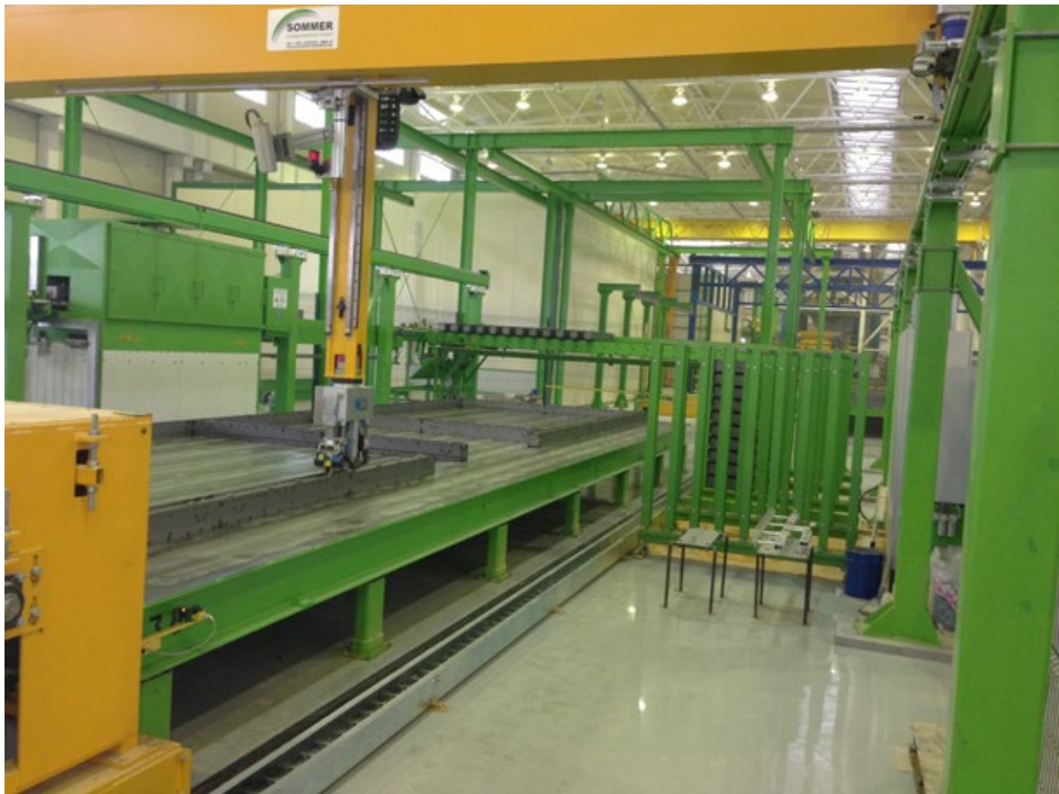
The modular design of the multifunctional formwork robot from SOMMER Anlagentechnik GmbH was adapted to the requirements